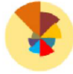
Table-1: AQI Bulletin