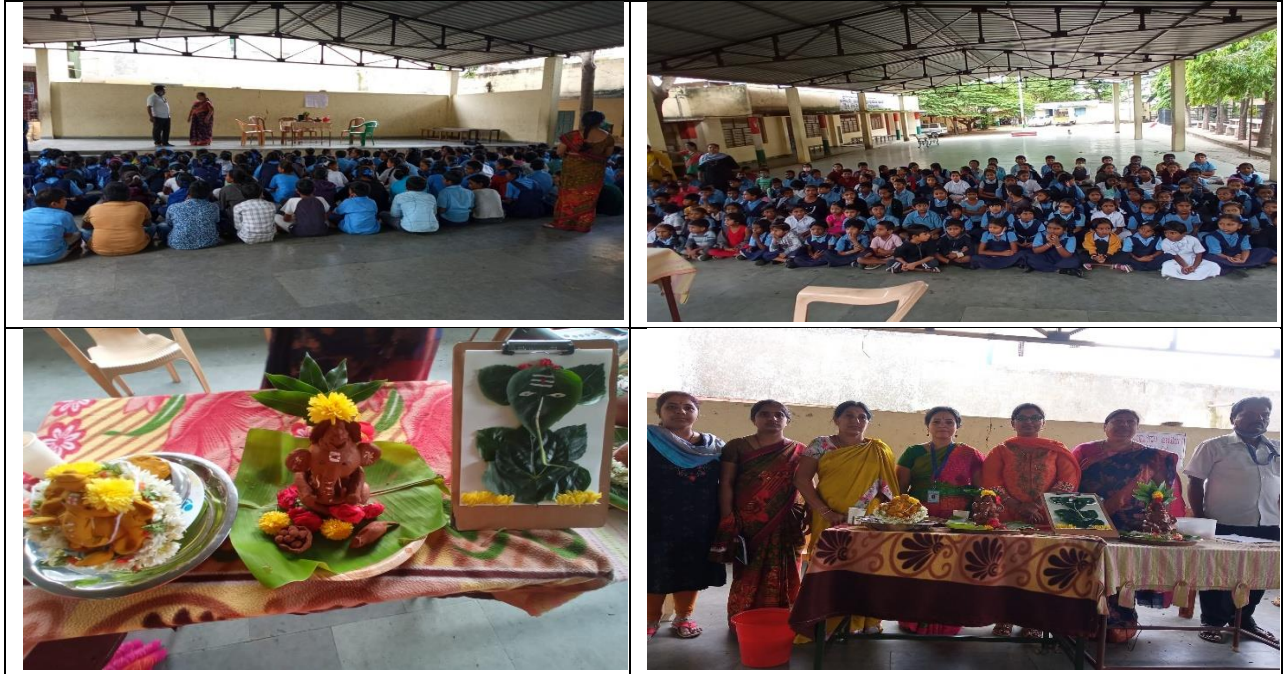
C) Photographs taken during the Awareness and Demonstration programme in Government Primary and High School on 23.8.2022