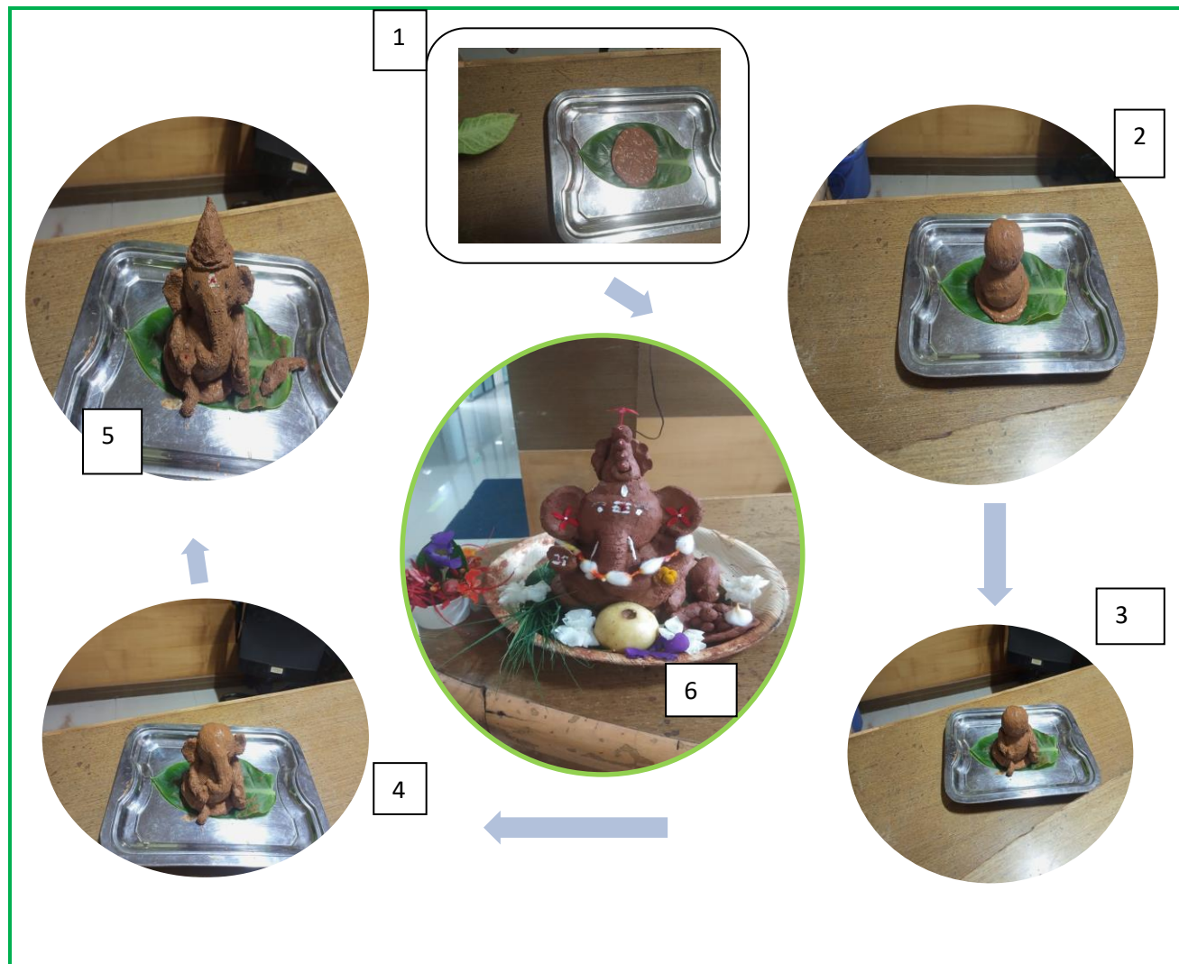
Figure 2. Step by Step Procedure for making Clay-seedling Ganesha idol