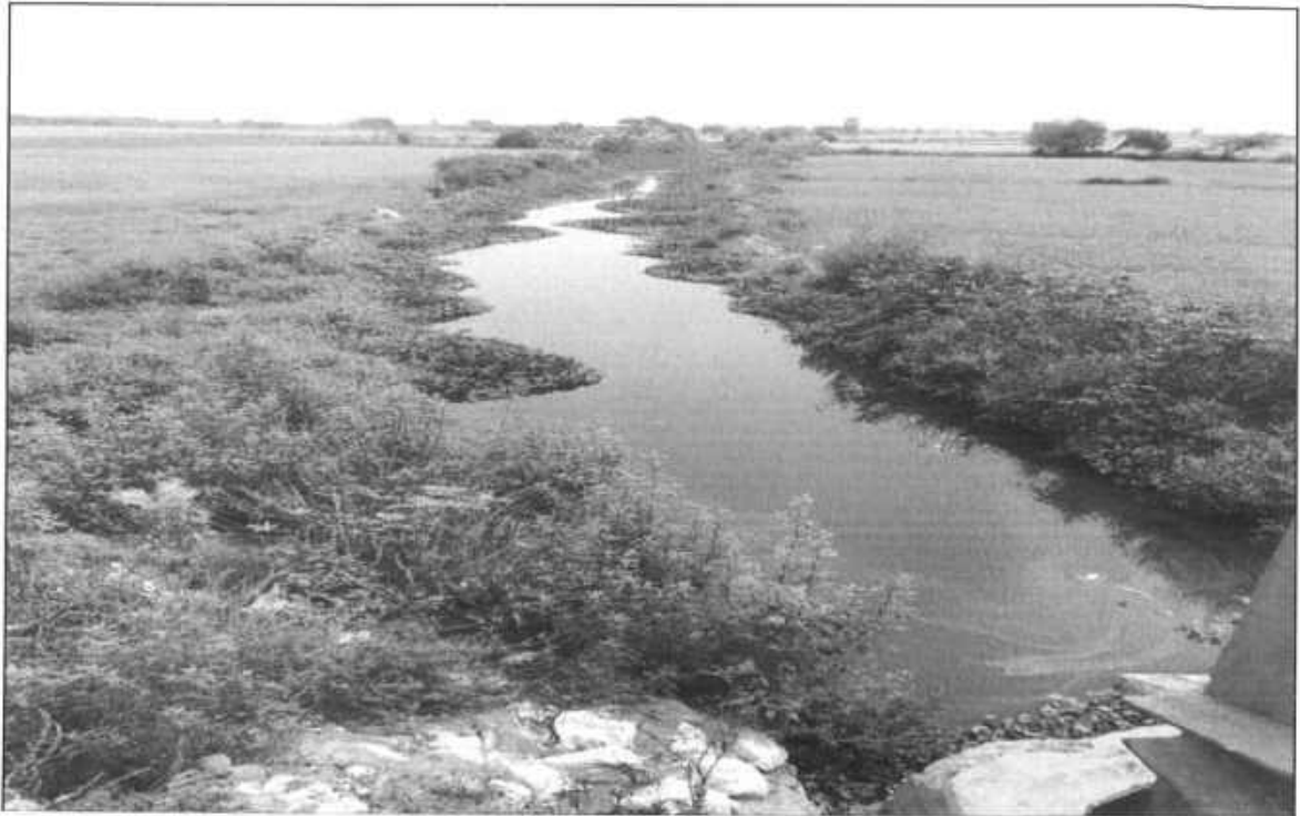
Figure 2: Untreated Effluent Discharge into Drain