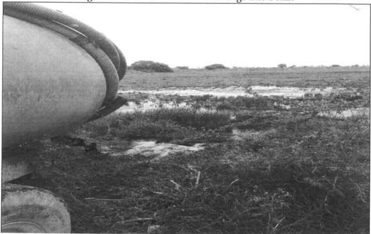
Figure 3: Tanker discharge the untreated waste from septic tank into open land