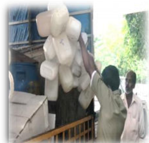
Plastic Clean drive by RD, Bengaluru