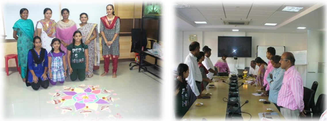
Eco-friendly Diwali celebration

The staff were encouraged to celebrate eco-friendly Deepavali festival without bursting of crackers. As a traditional practice during festival, drawing rangolis was also taken up to promote the theme.