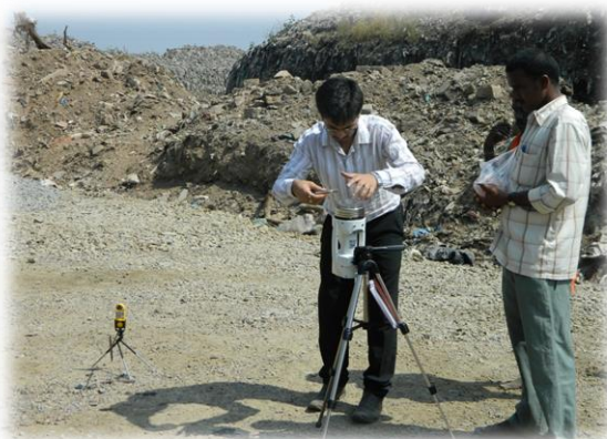
Training of students