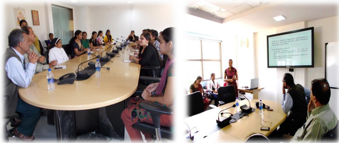
Awareness programme to post graduate students

The staff were encouraged to celebrate eco-friendly Deepavali festival without bursting of crackers. As a traditional practice during festival, drawing rangolis was also taken up to promote the theme.