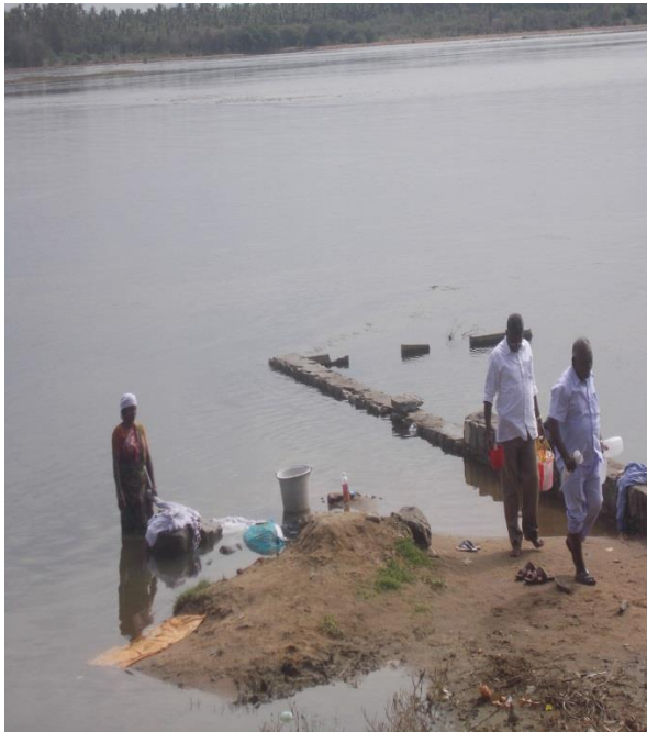
Photo graphs showing NWMP stations located in Karur district