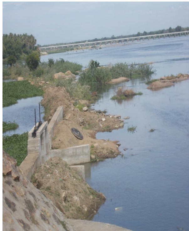
Fig. no.1 : NWMP Location located in Pugalur ( SC-3015) – near to this station activities such as washing of cloths, irrigation diversion head and drinking water intake well were found.