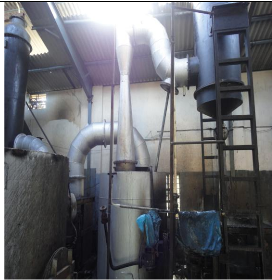
Fig.9: Quencher & Ventury Scrubber