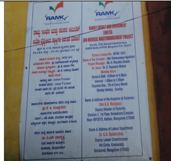
Fig.2: Near the entrance of the factory