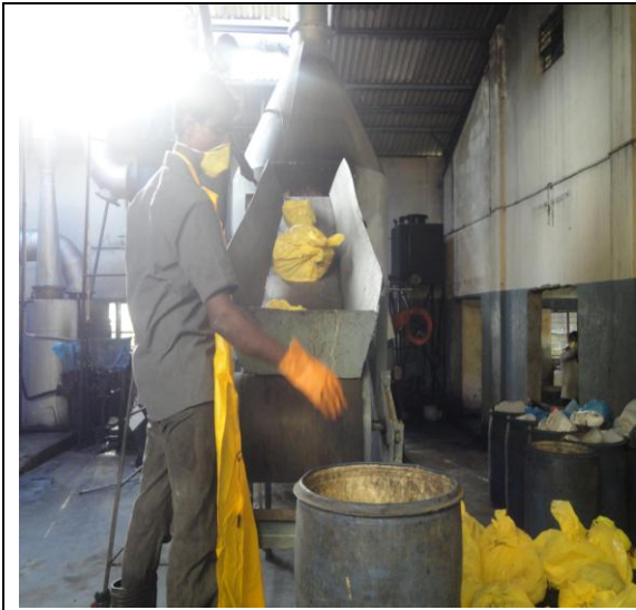
Fig.7: Loading of Bio-Medical Waste in Conveyor system