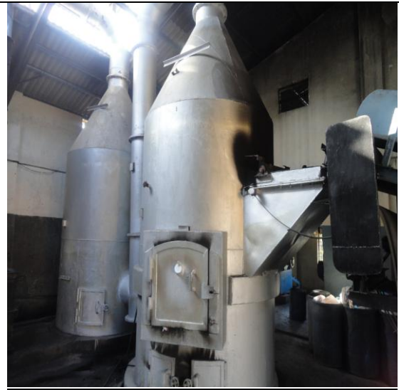
Fig.8: Primary & secondary chambers