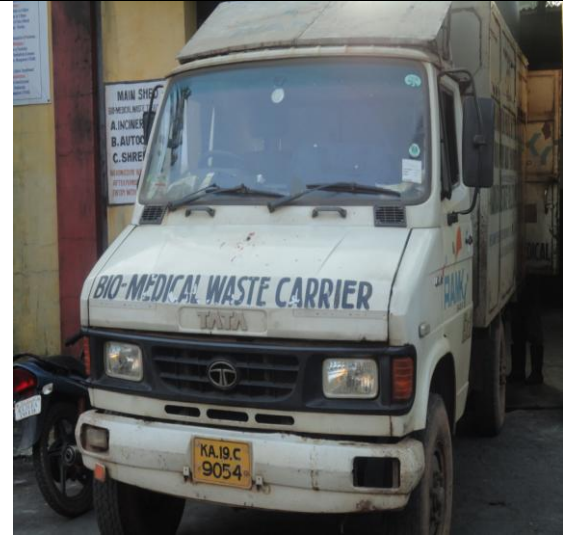
Fig.4: Vehicle used to transport Bio-Medical Waste