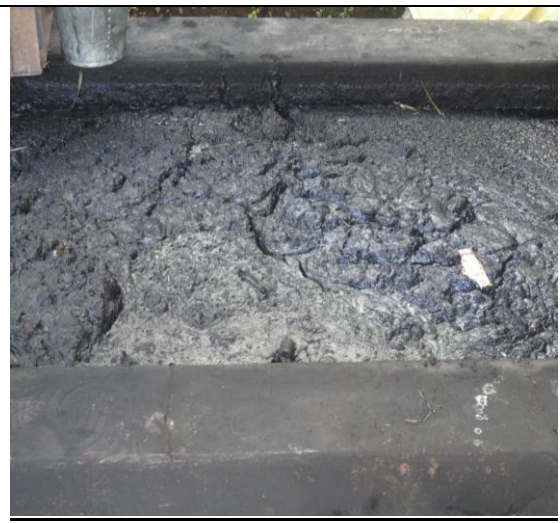
Fig.12: Sludge Drying Bed