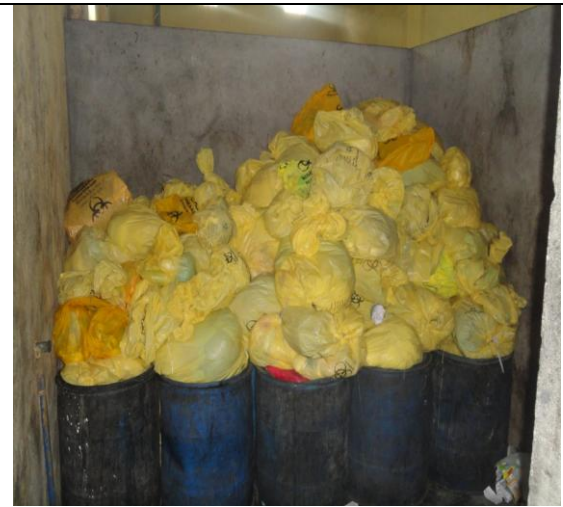
Fig.6: Storage of Bio-Medical Waste