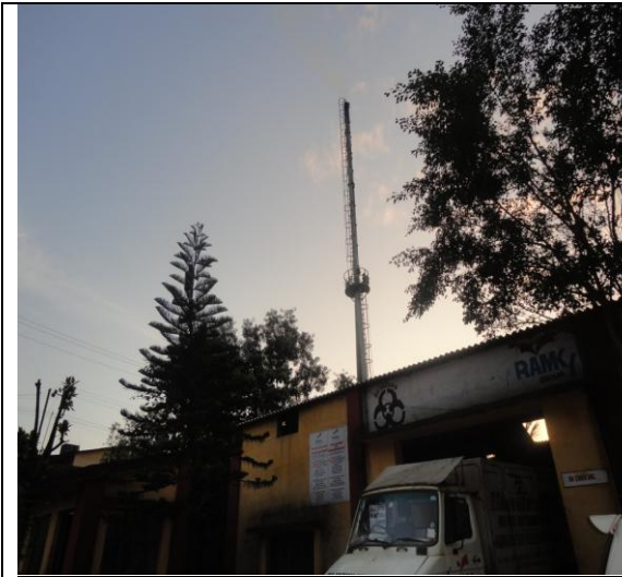
Fig.1: M/s Ramky Energy & Environment Ltd.