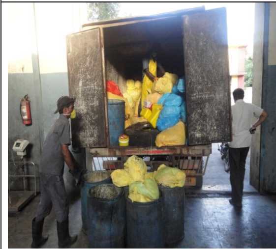
Fig.5: Unloading of Bio-Medical Waste