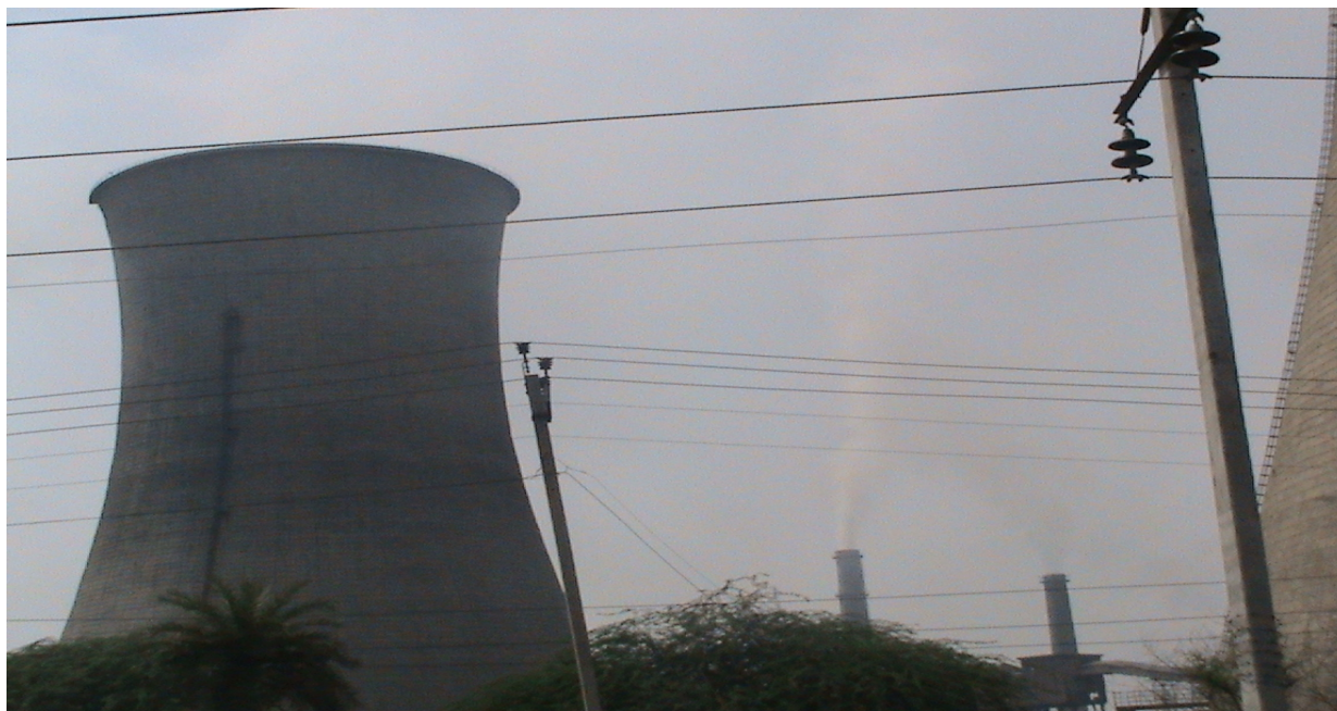
PANIPAT THERMAL POWER STATION

PTPS generates 1367.8 MW electricity and consumes 1.9 M 3 /hour oil and about 1000 MT/hour of Coal. The unit has six stacks installed with eight ESPs. Water Sprinkling System has been provided in Coal Handling Unit No. 3 and it need to be provided in the Coal Handling Units No. 1 and 2. AAQ and SPM level of two stacks exceeds the prescribed norms although ESP has been installed on all the stacks.