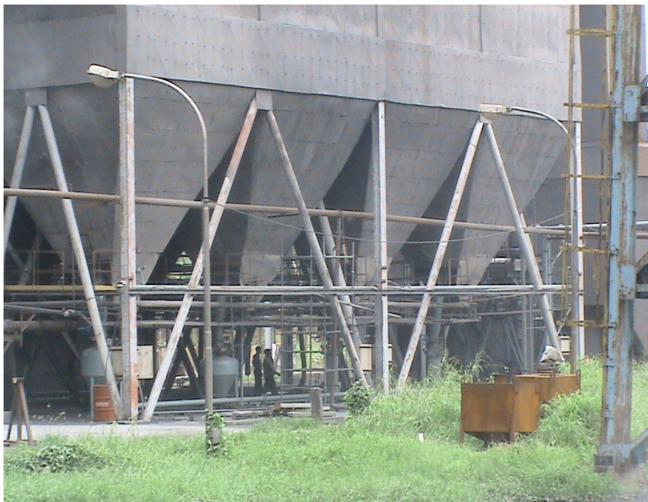
ESPs INSTALLED IN NATIONAL FERTILIZERS LIMITED, PANIPAT

NFL, Panipat has installed APCDs and comply the standards for emission. The unit also has captive power plant installed with ESPs as APCM and achieving the norms. The unit is in the process of implementation of Ammonia feed stock revamping by changing over of the feed stock and fuel from fuel Oil to natural gas. At present 9.654 MKCal energy per tone of Urea is consumed and it shall be reduced to 7.614 MKCal / MT leading to 1/3 reduction in coal and steam consumption by implementation of this project which is targeted to complete upto March, 2013. Therefore the Board anticipates that the emission of green house gases from NFL, Panipat will be reduced considerably on the completion of the proposed project.