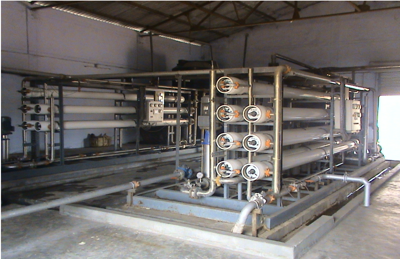
EFFLUENT TREATMENT THROUGH RO/NANO FILTER SYSTEM

Distillery unit consumes 390 M 3 /day water and have achieved the zero discharge. The entire quantity of effluent is treated through an ETP, RO / Nano Filtration System following by Bio-composting Process.