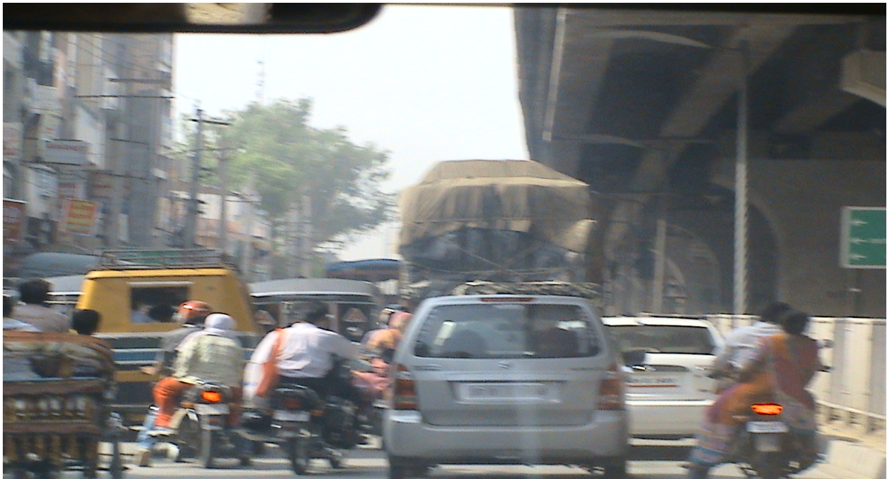
TRAFFIC CONGESTION UNDER PANIPAT FLYOVER ON G T ROAD