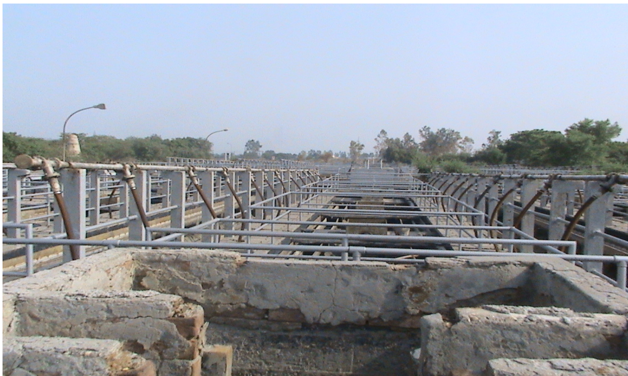
SEWAGE TREATMENT PLANT – 35 MLD

The city has partial sewerage system and STPs' of capacity 45 MLD in operation and 45 MLD in proposal by the Haryana Public Health Engineering Department.