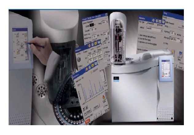
PERKIN ELMER GAS CHROMATOGRAPH CLARUS 500