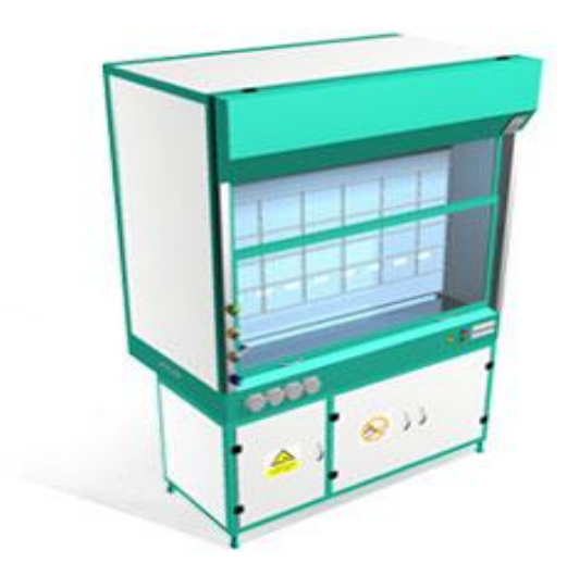
Low Constant Volume (LCV) Fume Chamber