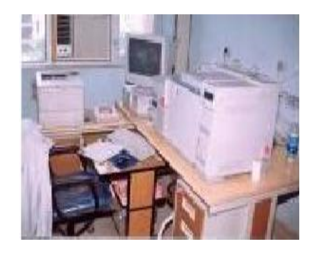
`AGILENT' GAS CHROMATOGRAPH – LOW RESOLUTION MASS SPECTROPHOTOMETER