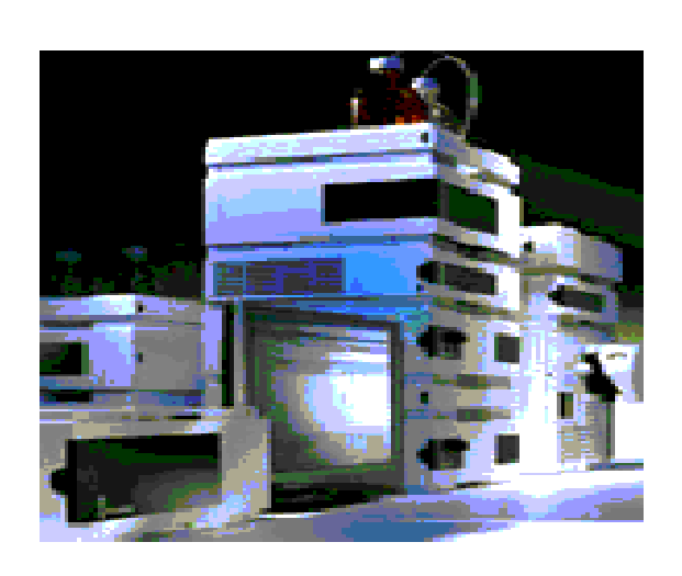
HIGH PERFORMANCE LIQUID CHROMATOGRAPH