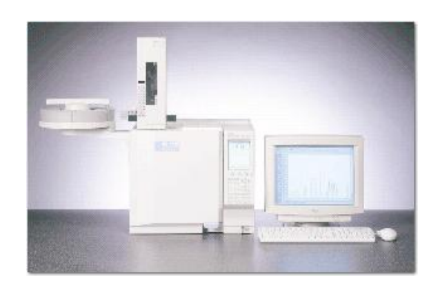
SHIMADZU GAS CHROMATOGRAPH