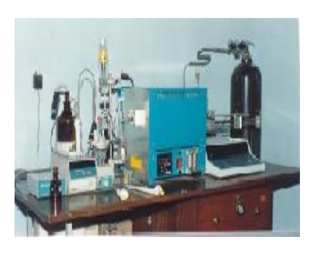
ADSORBABLE ORGANIC HALOGEN (AOX) ANALYZER