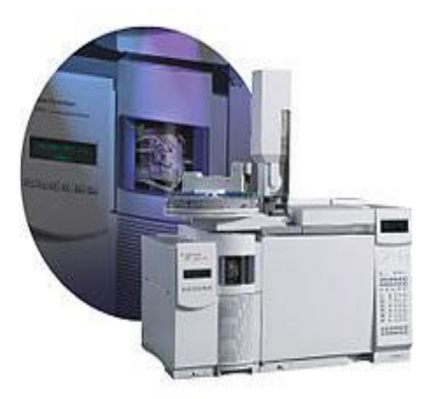
PERKIN ELMER GAS CHROMATOGRAPH – MASS SPECTROPHOTOMETER