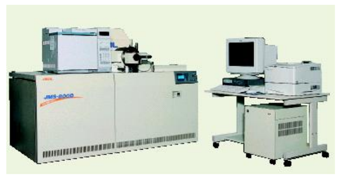
JMS 800D - HIGH RESOLUTION GAS CHROMATOGRAPH - HIGH RESOLUTION MASS SPECTROMETER (HRGC-HRMS)