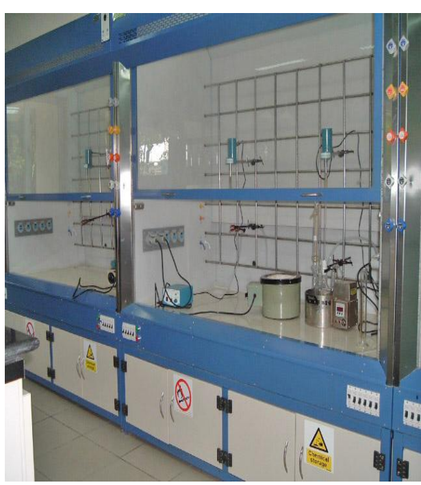
LCV FUME CHAMBERS WITH DIGITAL FLOW METER