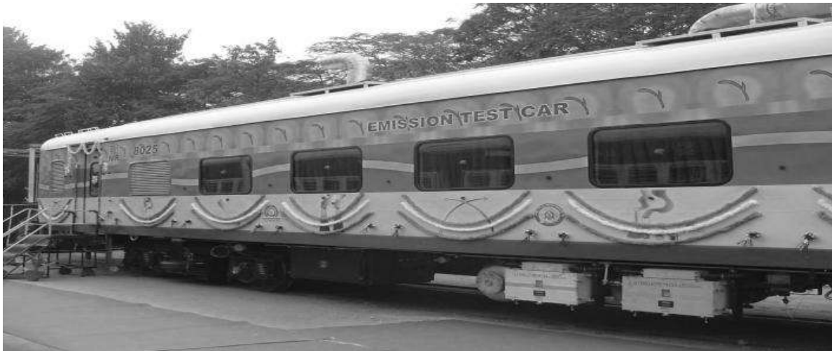
Figure 1: Outside view of emission test car

car also carries a portable Fuel Measurement System for measuring fuel consumption.