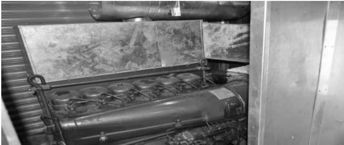
Figure 4: Internal view of DG set room