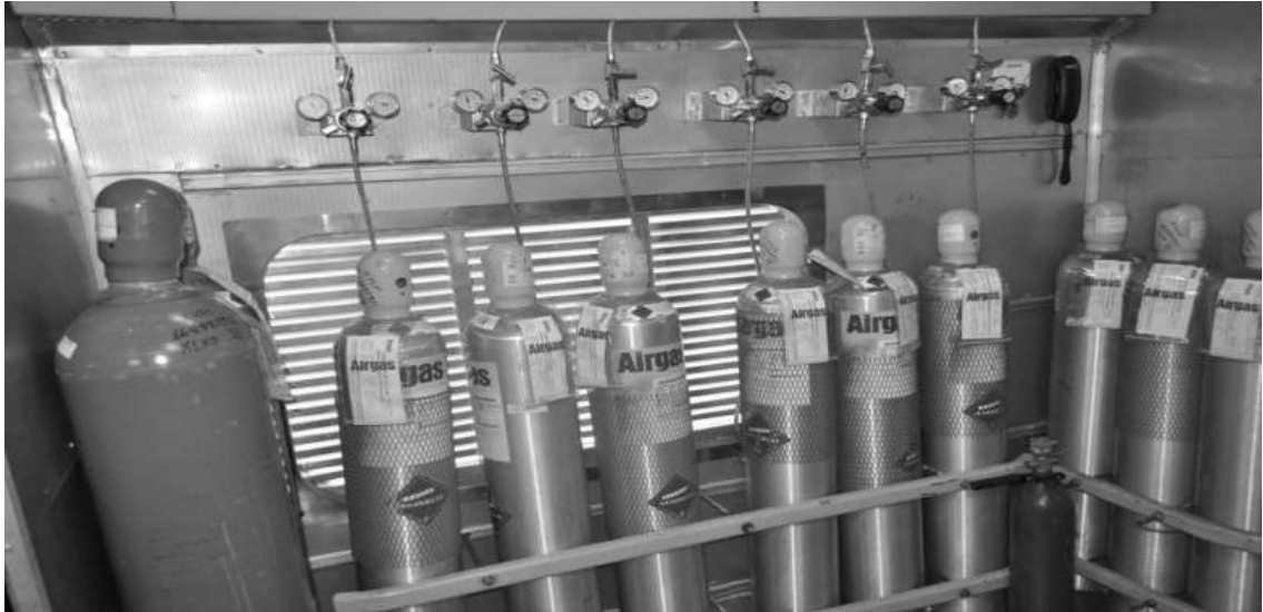
Figure 3: Internal view of gas room