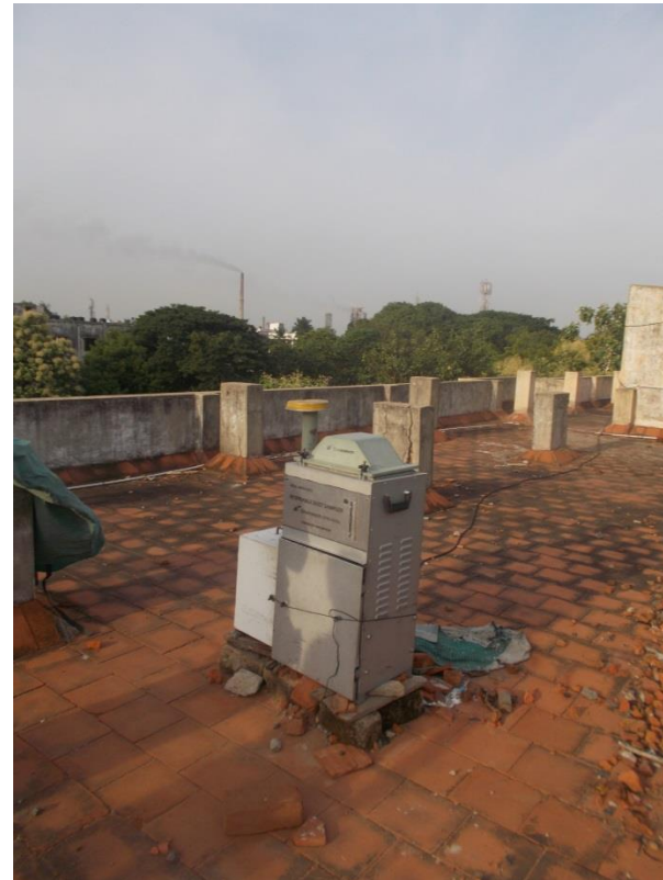
Fig no. 3 : NAMP Location located in Manali ( SC-71) – Industrial area