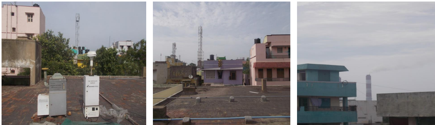
Fig no. 1 : NAMP station located in Ennore (SC -38) - Residential & Institutional area