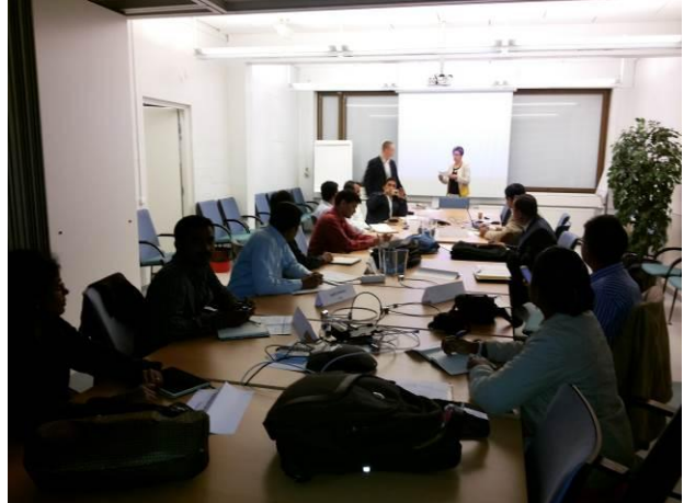
At VTT Lecturer Hall