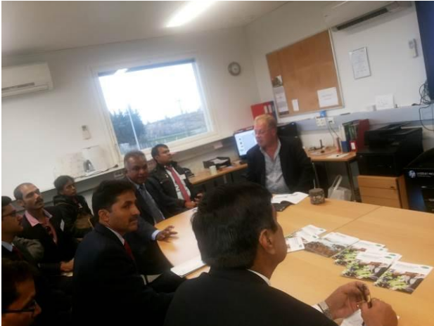
At sludge composting plant along with Ambassador

09 th September 2013 To 13 th September 2013