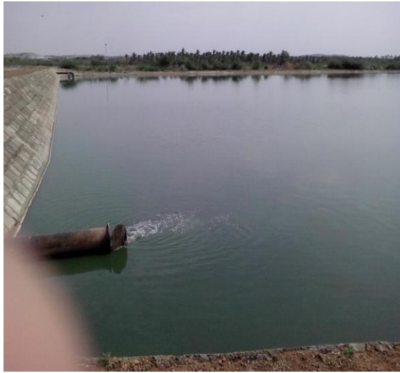
Fig 8: Facultative pond 1