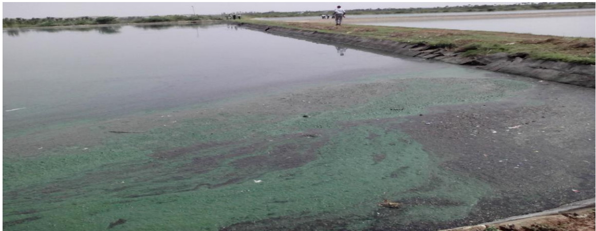
Fig 10: Facultative pond showing more algal growth on the surface