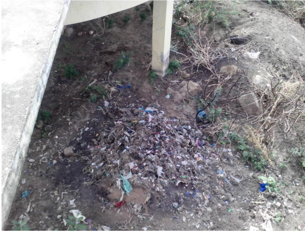
Fig 4: Solid waste from screen chamber is removed and dumped inside the unit creating unaesthetic condition.