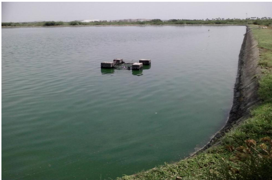
Fig 11: The maturation pond the final treatment unit of the palnt.