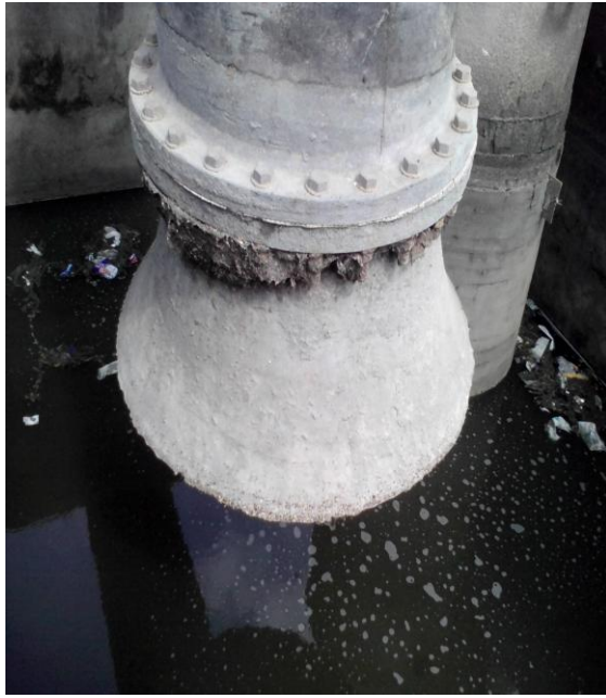
Fig 1: Inlet chamber