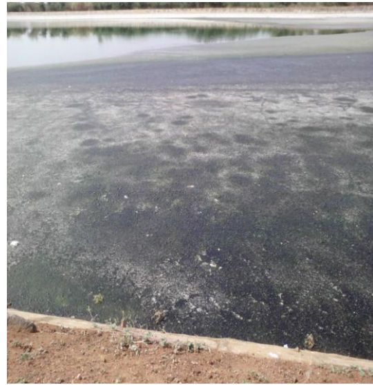
Fig 9: Facultative pond 2 in standby mode