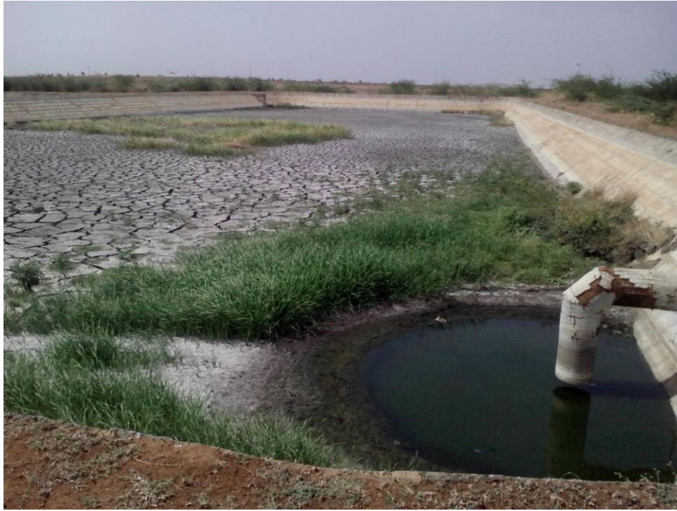
Fig 6: Anaerobic pond 2 in standby condition