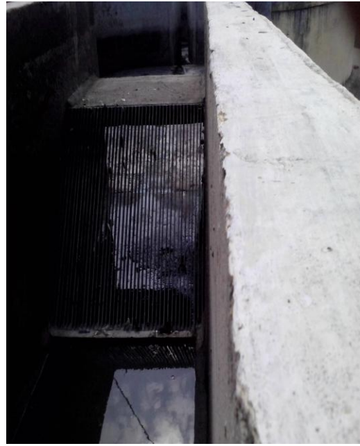
Fig 2: Screen Chamber