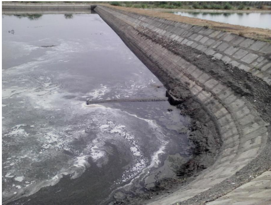
Fig 7: Anaerobic pond outlet