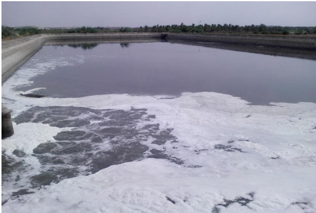
Fig 5: Anaerobic pond 1