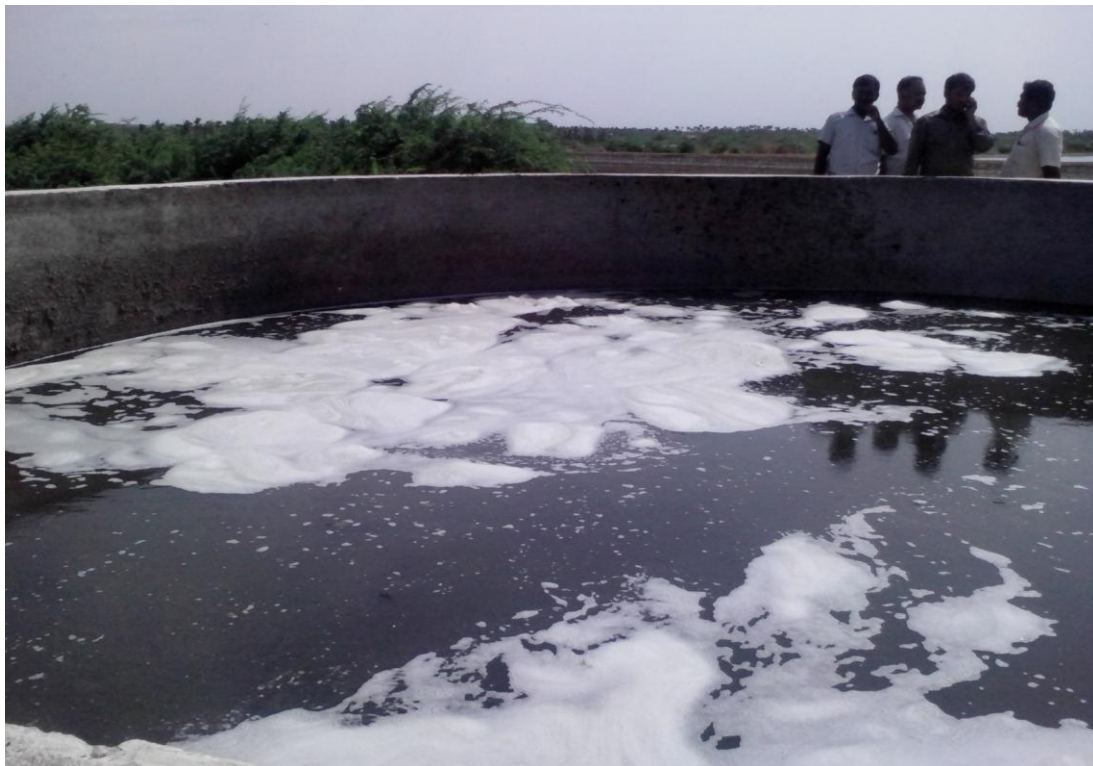
Fig 3: Grit Chamber