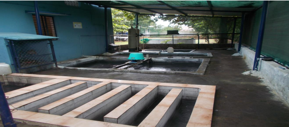
Fig.5: Effluent Treatment Plant