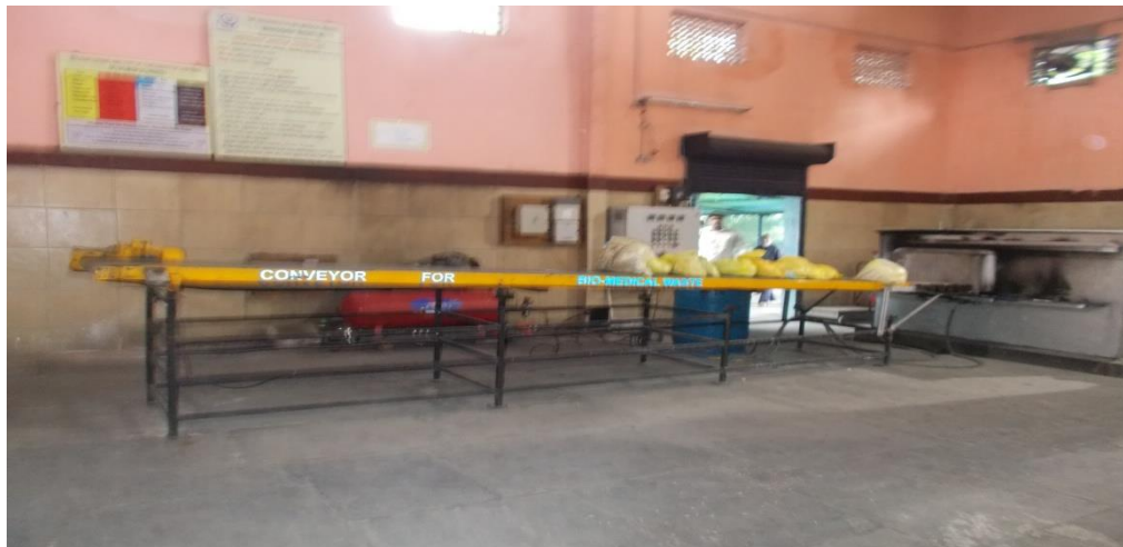
Fig.2: Conveyor system developed for auto loading of BM waste