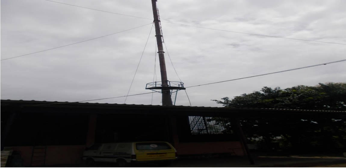
Fig.4: Stack with required platform