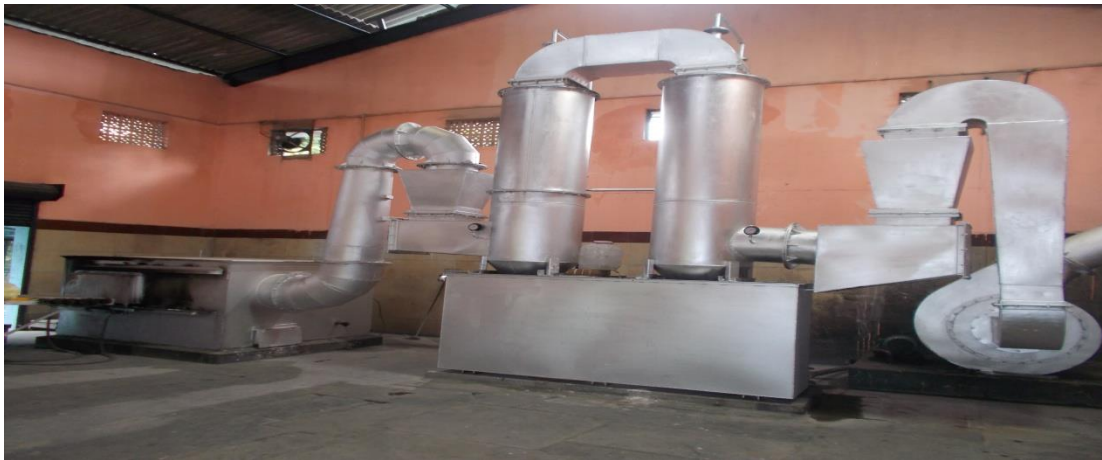
Fig.1: Incinerator of 100 kg/hr. with scrubber followed with Mist eliminator