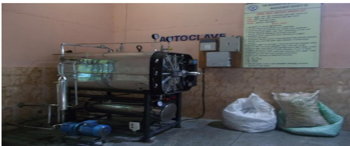
Fig.3: Auto-clave in-use