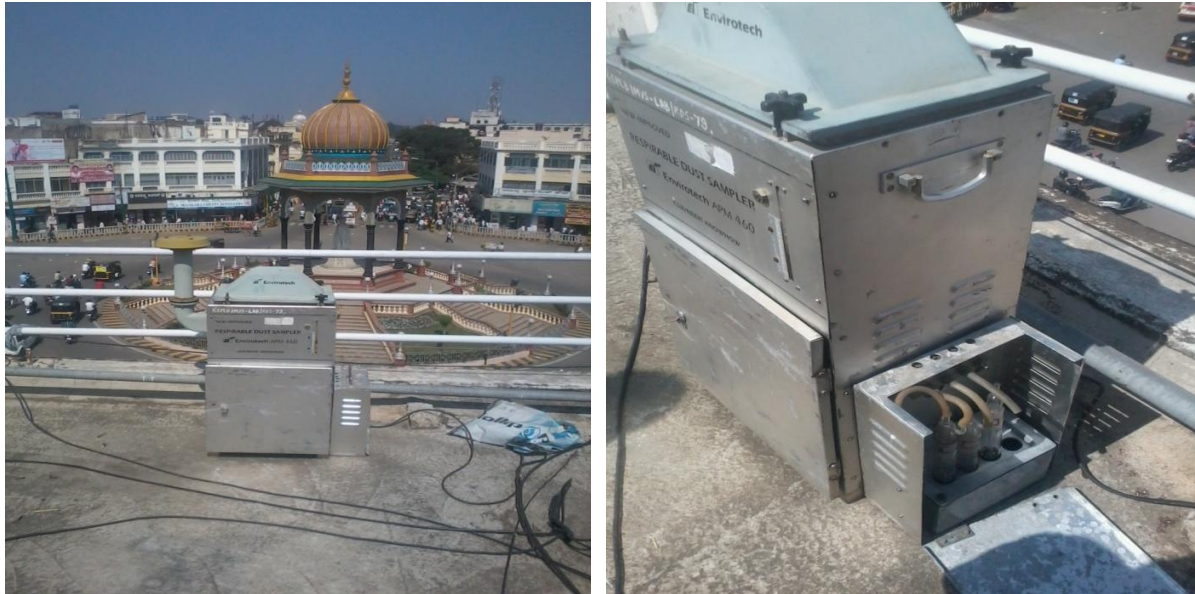
Fig No. 2: NAMP Station located in KSRTC Building, KR Circle (SC -040) - Commercial & Traffic Intersection