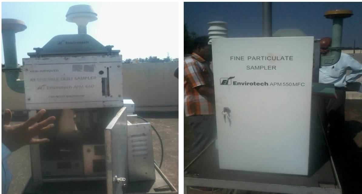
Fig no. 1: NAMP Station located in KSPCB Building terrace (SC -328) – Residential & Industrial area

The Mysuru city has two NAMP stations and it is maintained and regularly monitored by Mysuru city Regional Office, Karnataka SPCB. One station is located at Terrace of Mysuru KSPCB building (SC - 328) covering Residential and Industrial areas. Another Station is located at Terrace of KSRTC Building, KR Circle (SC - 040) covering Residential and commercial areas. The monitoring of these stations is carried out by Mysuru Regional Office, Karnataka SPCB, the monitoring of pollutants is carried out for 24 hours (4- hourly sampling for gaseous pollutants and 8 hourly sampling for particulate matter with a frequency of twice a week. The parameters monitored are Sulphur dioxide (SO 2 ), Nitrogen dioxide (NO 2 ), Particulate Matter (PM 10 ), Ammonia (NH 3 ) and Lead (Pb). The figure below shows the NAMP stations located in Mysuru city.