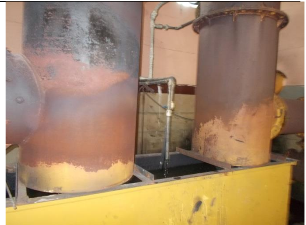
Fig.8: No pressure gauge or u- tube manometer to measure the pressure drop across the venturi