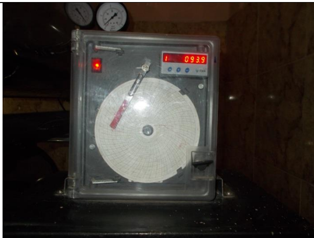
Fig.15: Autoclave temperature recording chart, where batch number, date are not mentioned.