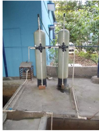
Fig.14: Sand filter and activated carbon filter installation at ETP.