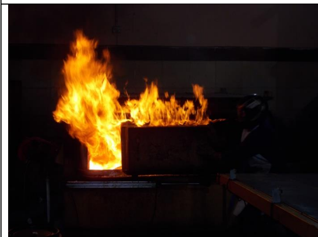
Fig.9: Negative draft is not maintained at primary combustion chamber, emission during charging.