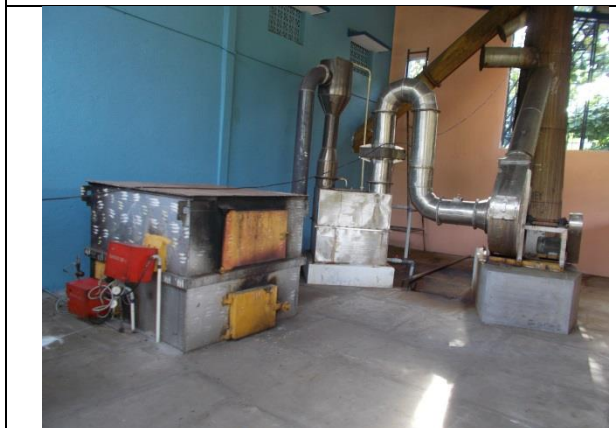
Fig.3: Incinerator of 50 kg/hr. with APCD, ID connected to common stack..