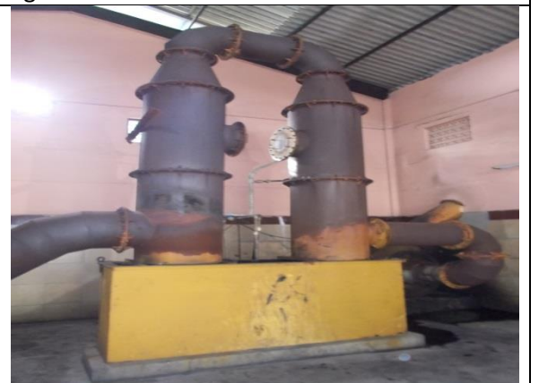
Fig.4: Scrubber connected to 100 kg/hr. incinerator & No mist collector attached