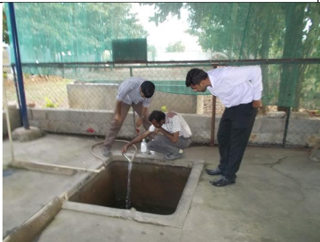
Fig.17: sample collected in presence of industry representative.