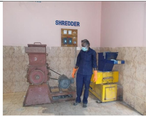
Fig.16: shredder installed and found in operation.