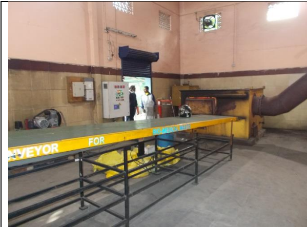
Fig.7: Conveyor system developed for charging is under repair and manually charged.