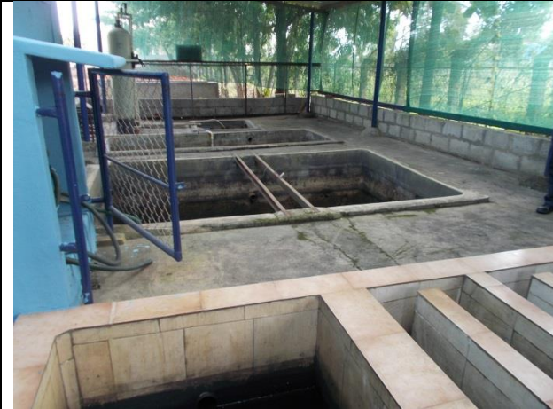
Fig.13: ETP set – up