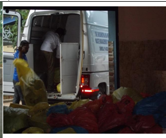
Fig.18: wastes unloaded from the vehicle at the unit.