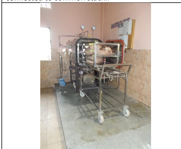
Fig.5: Autoclave of 430 lit. Capacity in operation.