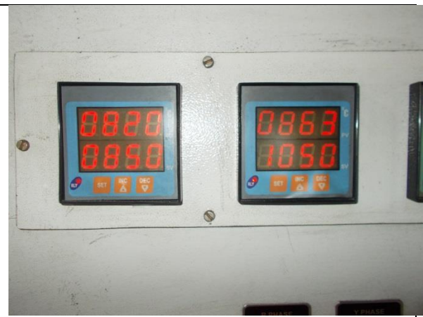
Fig.2: Operating parameter indicator, Secondary temperature showing only 863°C against 1050°C.