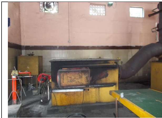
Fig.1: Incinerator of 100 kg/hr. in operation.