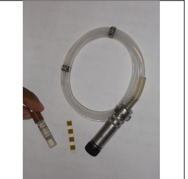
Fig.12: strip test arrangement for autoclaving of wastes. One round test conducted.