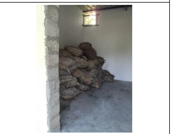
Fig.10: Ashes are packed in gunny bags and stored in a room for disposal.