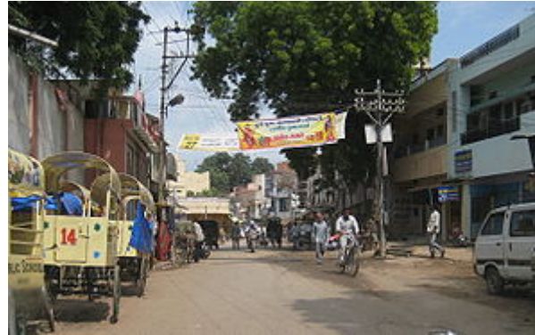
A shopping street in Mirzapur

1) Dress includes dhoti , kurta and toga (gamachhaa) (the local style also called the GANWAAR style of dress) on shoulders of men; the other side of this cultural coin shows the scented regional perfumes and earrings on women along with sarees , kara (bracelets), bangles, bajuband (arm bands), kakani, in hands and hasali (thick silver neck rings) on the neck, bichhiya (toe rings) on the toes, kanachadi in the ears put on kardhani (a knitted silver belt) in the waist.