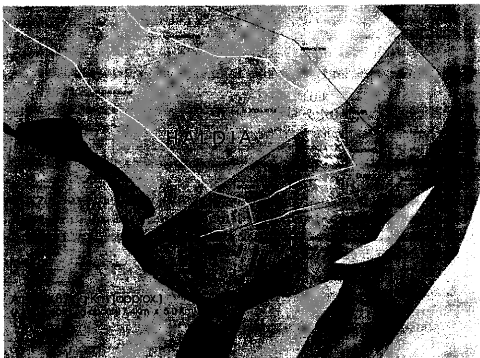
Fig. -I: Boundary of critically polluted area in Haldia as per the MoEF Memo No. J-11013/5/2010-IA.II(1) dated 15.03.2010.

Haldia is located at distance of 125 km South-West of Kolkata and 50 km from the Bay of Bengal at the confluence of three rivers Hooghly, Haldi & Rupnarayan in Purba Midnapore district. Haldia is also one of the biggest ports in the Eastern region and focal point for industrial development in West Bengal. The Haldia Planning Area (HPA) is bounded by the rivers Hooghly, Haldi & Hajli canal and covers a total area of around 326.85 sq. km. spread over 258 mouzas. The HPA is divided in four police stations namely, Haldia, Mahisadal, Sutahata & Durgachak. The area under Haldia police station is completely urbanized and fall within the Haldia Municipal area. The Sutahata police station, which consists of mouzas of both Sutahata I & II blocks, is the largest police station with 75% of the mouzas under rural occupation.