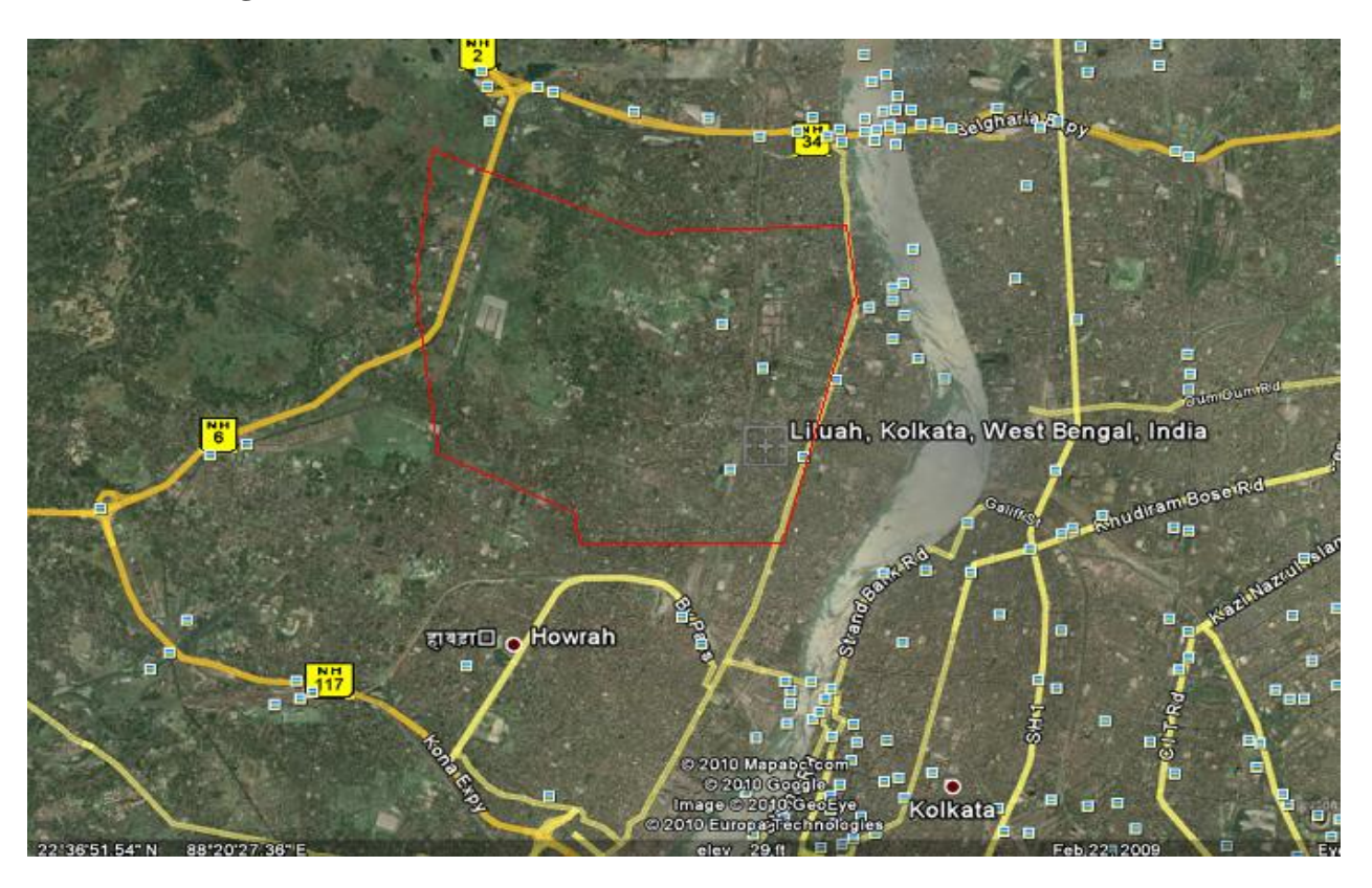
\begin{tabular}{ll} Fig. \ -3: Boundary \ (in \ Red \ line) \ of \ critically \ polluted \ area \ by \ CPCB \ at \ Jalan \ Industrial \ Complex \end{tabular}