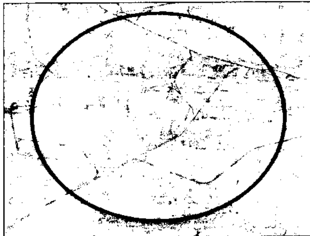
Fig. -2: Boundary (in Red line) of critically polluted area in Asansol ( Burnpur area surrounding IISCO) demarcated by CPCB (Green line shows the area where industries are located within the identified area and have major impact), MoEF Memo No. J-11013/5/2010-1A.11(I) dated 15.03.2010